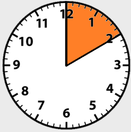
10 minutes a day