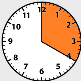
20 minutes a day

Which is nearly six months of school between K-12.